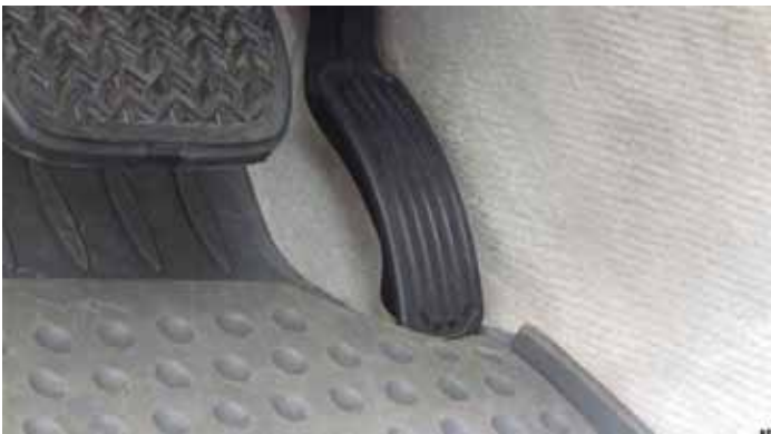
Stuck accelerator pedals (believed caused by Toyota floor mats) led to a recall of nearly 15 million Toyotas.

From 2005-2010 almost 15 million Toyota cars were recalled for UA problems due to “stuck accelerator pedals caused by floor mats,” “sticking accelerator pedals” or to get an electronic upgrade with a brake override.