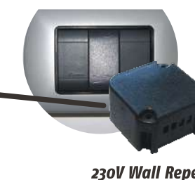
230V Wall Repeater